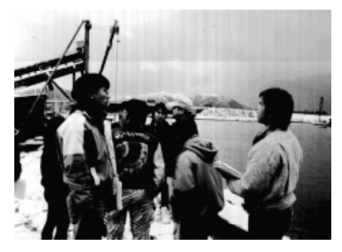
Students are expected to apply their knowledge in practical problems. Here the students visiting a local fish plant, looking for ways to apply quality methods.

They apply these methods to school operations, such as the cafeteria, design of dorm rules and regulations, and maintenance.