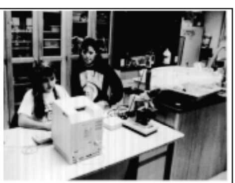
Two students in biology class use a microscope to create a scanned image which they will use in their homework report

I went to Sitka because I had heard that the were using TQM in education. What I saw exceeded my expectations. It is also clear that what has been done at MEHS cannot be "cloned" and simply reproduced elsewhere. Mt. Edgecumbe High School is a residential school. The enrollment is very small, compared to the national average. The ratio of students to teachers is smaller than the national average. What we have at MEHS is a small laboratory in which it has been demonstrated that Quality Management Principles work in education.